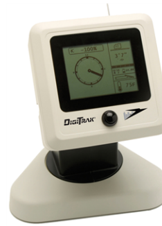
Falcon Compact Display