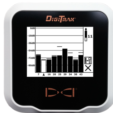
Falcon Frequency Optimizer