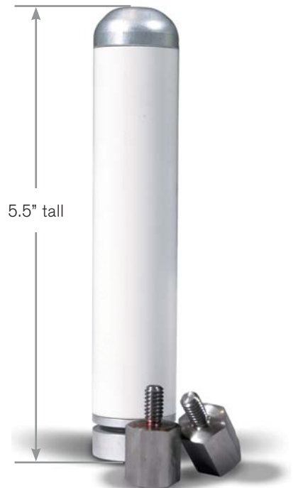
815 Hz Fiber Conduit Sonde