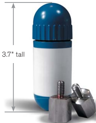
815 Hz Pipe Sonde

Rycom Instruments®, Inc. locating products are designed and manufactured to make utility locating as accurate as you need and as simple as you want. For more information on Rycom Instruments® Sondes, or any other Rycom Instruments® product, please call us toll free at 1-800-851-7347 or visit us online at www.rycominstruments.com .