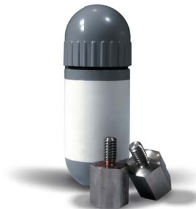
512 Hz Pipe Sonde